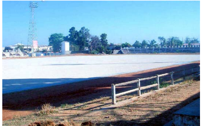
The prepared ground is waiting for the football turf