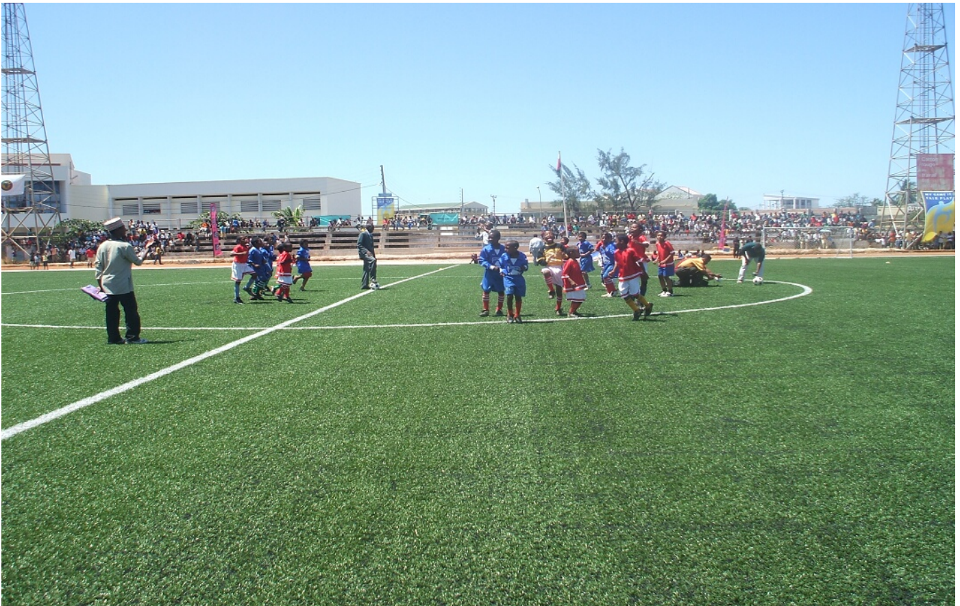
The first users of the new football turf were ... the football stars of tomorrow.