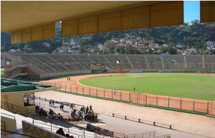
Municipality Stadium of Rabemananjara, Mahajanga

Further information on Win in Africa with Africa: http://www.fifa.com/mm/goalprojectWinAF_E.pdf