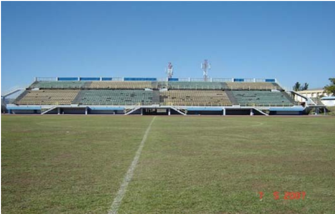
Setsoto stadium, Maseru

Further information on Win in Africa with Africa: http://www.fifa.com/mm/goalprojectWinAF_E.pdf