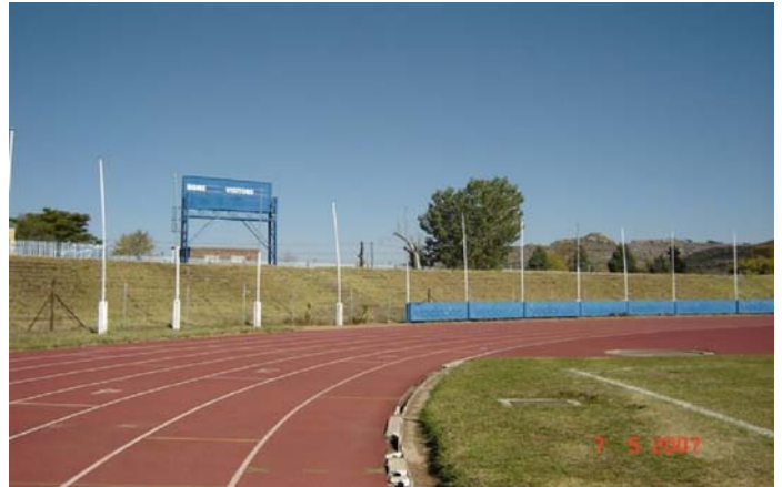
Prior to the installation of the football turf.