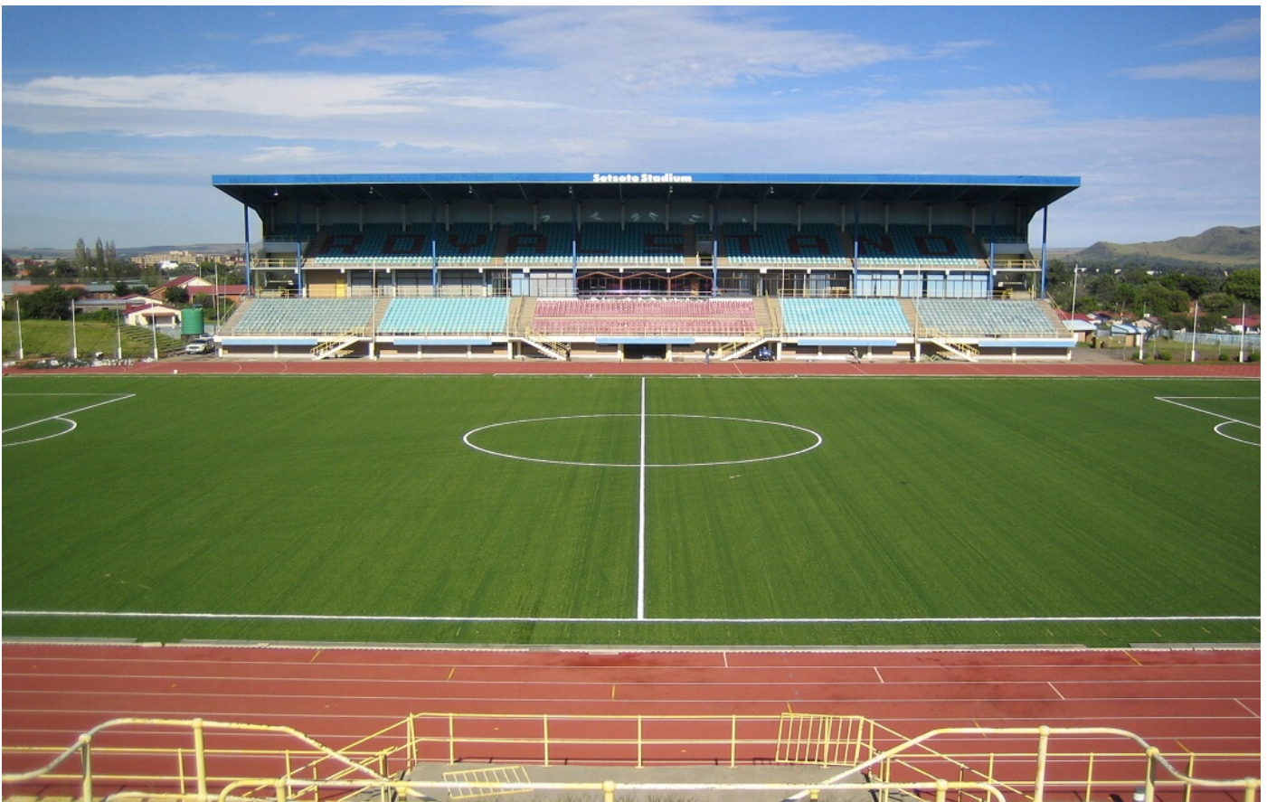
Now that a FIFA-approved football turf pitch is in place, the Setsoto stadium is ready to host international matches.