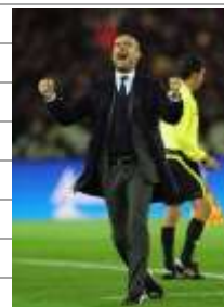
Pep Guardiola, ESP – coach of winning team Barcelona FC (ESP) in 2009 and 2011 and of FC Bayern München (GER) in 2013.