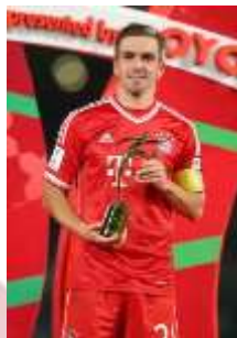
Left: Lionel MESSI, ARG (Barcelona FC) winner of the adidas Golden Ball 2011. Right: Carles PUYOL, ESP, captain of FC Barcelona lifts up the FIFA Fair Play Award in 2011 and Philipp LAHM in 2013.