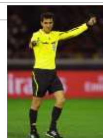
Ravshan Irmatov, UZB – referee of two FIFA Club World Cup final matches: 2008 and 2011.