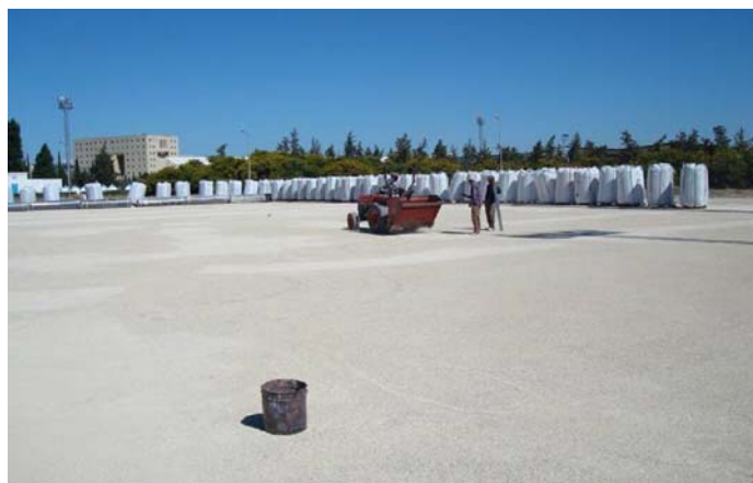
Preparation of the ground.

Further information on Win in Africa with Africa: http://www.fifa.com/mm/goalprojectWinAF_E.pdf