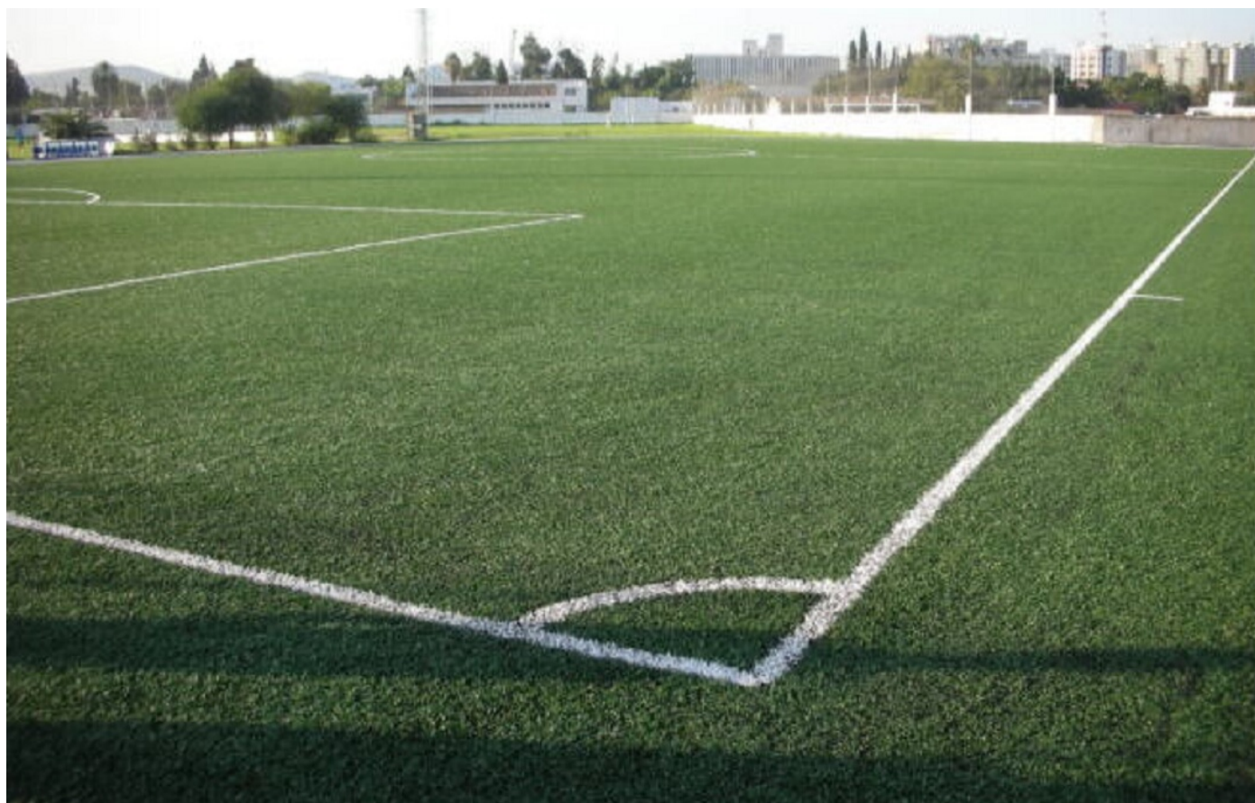
This football turf was laid in the specialised technical centre for referees, built within the Goal programme's second project