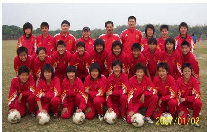
Chinese Taipei women's national team

Does an organised women's football set-up exist? yes If so, since when? 2000 From which age on, players are registered? 11 Women's teams (open or over 16 years) 21 Women's teams (below 16 years, youth) 52 National competition (or women's league) yes Regional competitions n/a University competitions yes School competitions yes Futsal competitions yes National "A" team yes National youth teams: age categories U-19