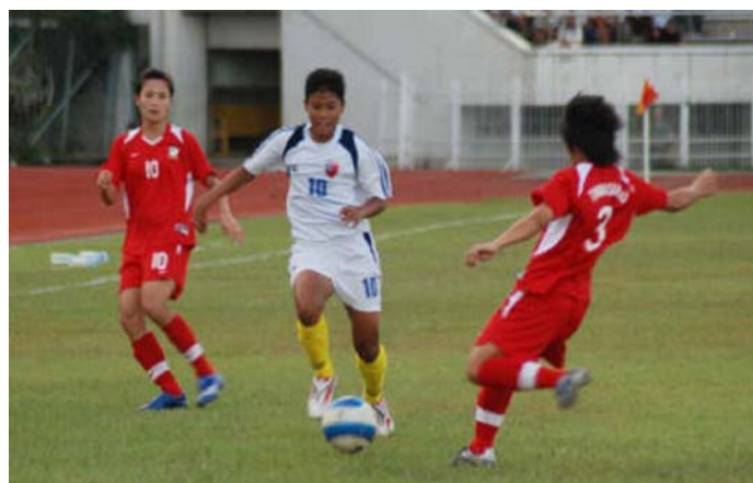
2007 ASEAN Women's Championship - Myanmar v. Thailand

When, in 1995, today's FIFA President said "The future of football is feminine", it was more than mere lip service. It reflected a strong belief in the huge potential that women's football has to develop. Ever since, FIFA has given targeted support for the efforts of associations who offer women the same opportunities to develop as male players. Launched in 1998, FIFA's Financial Assistance Programme (FAP) introduced a requirement in 2004 for the associations and confederations to invest at least 4% of their FAP funding into women's football. This threshold was increased to 10% in 2005. On top of this commitment, FIFA also promotes the women's game in more general ways by directly financing women's matches and organising competitions and symposiums. Thanks to its development programmes, FIFA is also playing an active role in the training of administrators, coaches, referees and sports doctors.