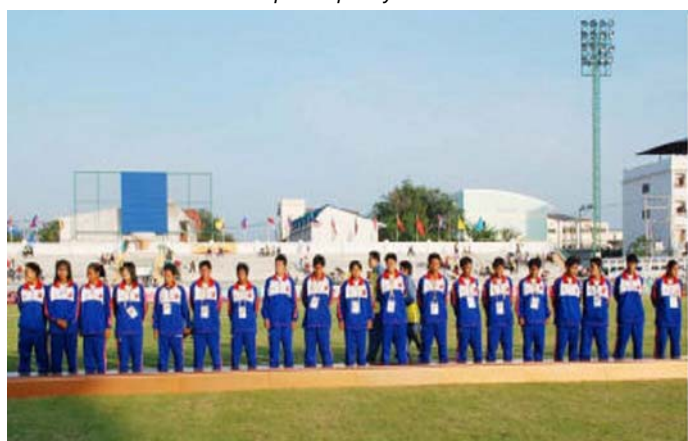
Thailand's women won the bronze medals