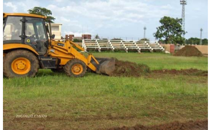
Removal of humus in preparation for the foundations of the new football turf pitch.