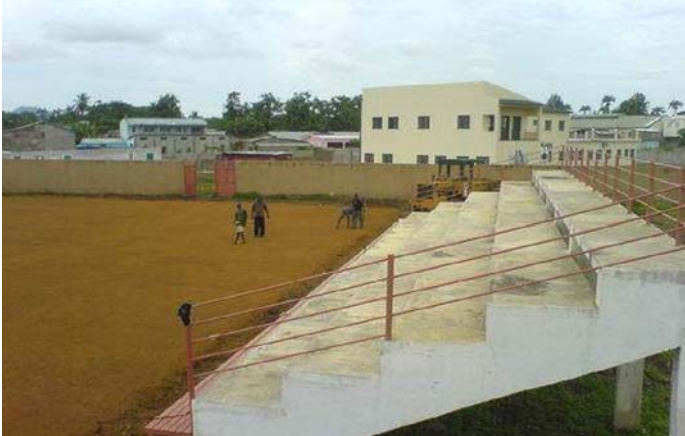
The grass at the national stadium in São Tomé was damaged by the heat and the sun.

Further information on Win in Africa with Africa: http://www.fifa.com/mm/goalproject/WinAF_E.pdf