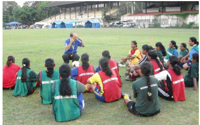
Women's football seminar in Sri Lanka

When, in 1995, today's FIFA President said "The future of football is feminine", it was more than mere lip service. It reflected a strong belief in the huge potential that women's football has to develop. Ever since, FIFA has given targeted support for the efforts of associations who offer women the same opportunities to develop as male players. Launched in 1998, FIFA's Financial Assistance Programme (FAP) introduced a requirement in 2004 for the associations and confederations to invest at least 4% of their FAP funding into women's football. This threshold was increased to 10% in 2005. On top of this commitment, FIFA also promotes the women's game in more general ways by directly financing women's matches and organising competitions and symposiums. Thanks to its development programmes, FIFA is also playing an active role in the training of administrators, coaches, referees and sports doctors.