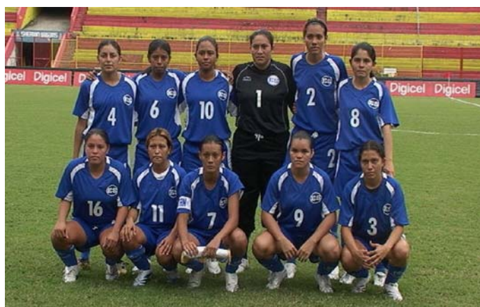
Women's senior national team