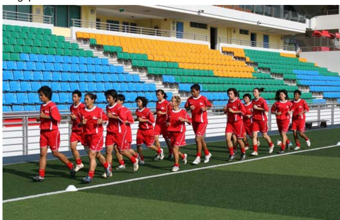
Warm-up during a coaching course in Singapore