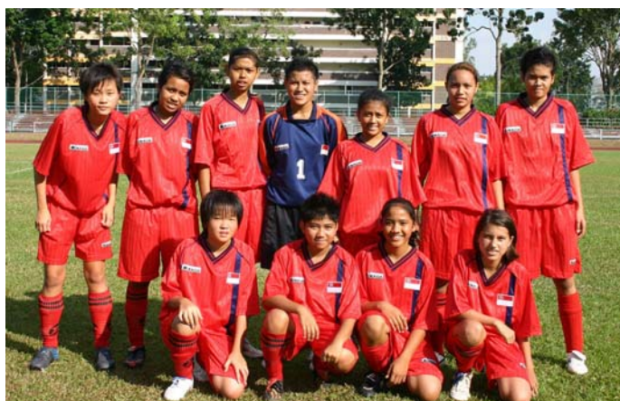
Singapore U-17 women's national team

When, in 1995, today's FIFA President said "The future of football is feminine", it was more than mere lip service. It reflected a strong belief in the huge potential that women's football has to develop. Ever since, FIFA has given targeted support for the efforts of associations who offer women the same opportunities to develop as male players. Launched in 1998, FIFA's Financial Assistance Programme (FAP) introduced a requirement in 2004 for the associations and confederations to invest at least 4% of their FAP funding into women's football. This threshold was increased to 10% in 2005. On top of this commitment, FIFA also promotes the women's game in more general ways by directly financing women's matches and organising competitions and symposiums. Thanks to its development programmes, FIFA is also playing an active role in the training of administrators, coaches, referees and sports doctors.