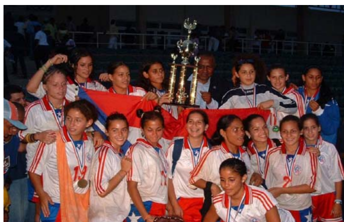
The U-19 women's national team