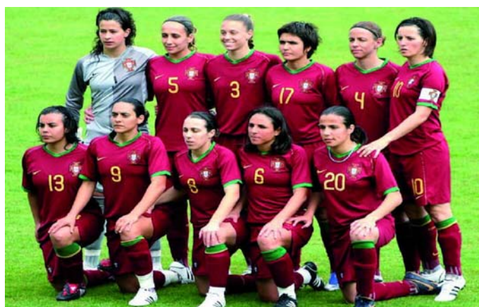
The Portuguese senior women's national team 2007