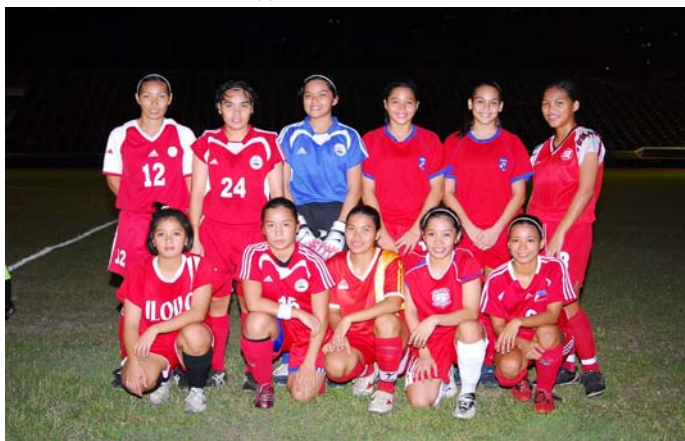
The women's national team at the FIFA-led symposium in Manila in 2006