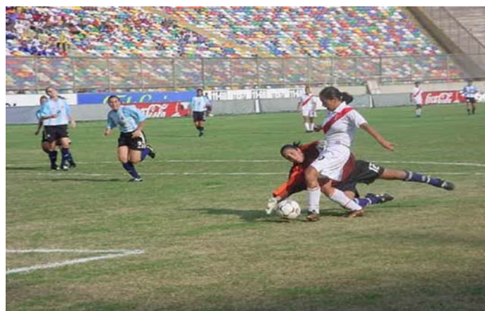
Peru v. Argentina

When, in 1995, today's FIFA President said "The future of football is feminine", it was more than mere lip service. It reflected a strong belief in the huge potential that women's football has to develop. Ever since, FIFA has given targeted support for the efforts of associations who offer women the same opportunities to develop as male players. Launched in 1998, FIFA's Financial Assistance Programme (FAP) introduced a requirement in 2004 for the associations and confederations to invest at least 4% of their FAP funding into women's football. This threshold was increased to 10% in 2005. On top of this commitment, FIFA also promotes the women's game in more general ways by directly financing women's matches and organising competitions and symposiums. Thanks to its development programmes, FIFA is also playing an active role in the training of administrators, coaches, referees and sports doctors.