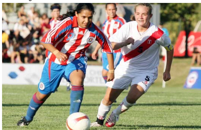
Peru v. Paraguay