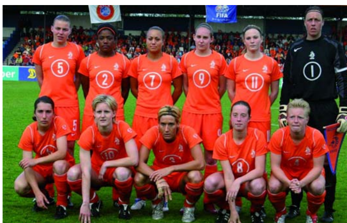
The women's national team of the Netherlands