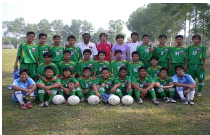
The U-19 women's national team