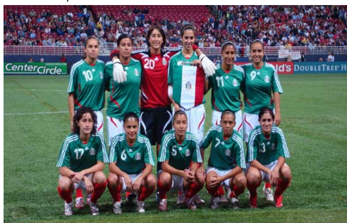
Women's national team - the "Green Team"