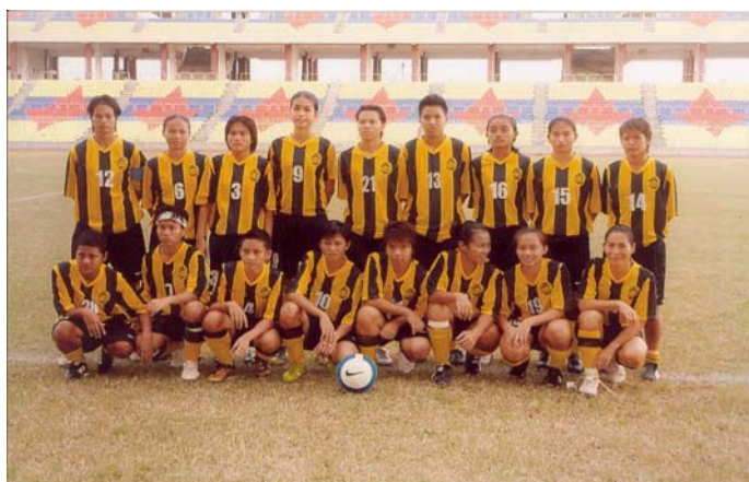
The Malaysia women's senior national team

When, in 1995, today's FIFA President said "The future of football is feminine", it was more than mere lip service. It reflected a strong belief in the huge potential that women's football has to develop. Ever since, FIFA has given targeted support for the efforts of associations who offer women the same opportunities to develop as male players. Launched in 1998, FIFA's Financial Assistance Programme (FAP) introduced a requirement in 2004 for the associations and confederations to invest at least 4% of their FAP funding into women's football. This threshold was increased to 10% in 2005. On top of this commitment, FIFA also promotes the women's game in more general ways by directly financing women's matches and organising competitions and symposiums. Thanks to its development programmes, FIFA is also playing an active role in the training of administrators, coaches, referees and sports doctors.