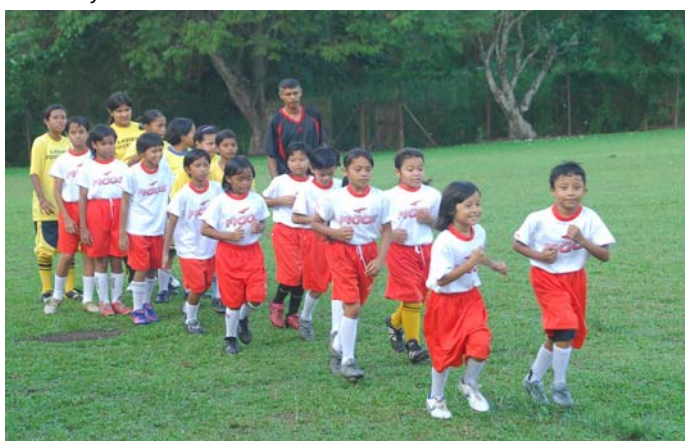
Training session with promising football talent