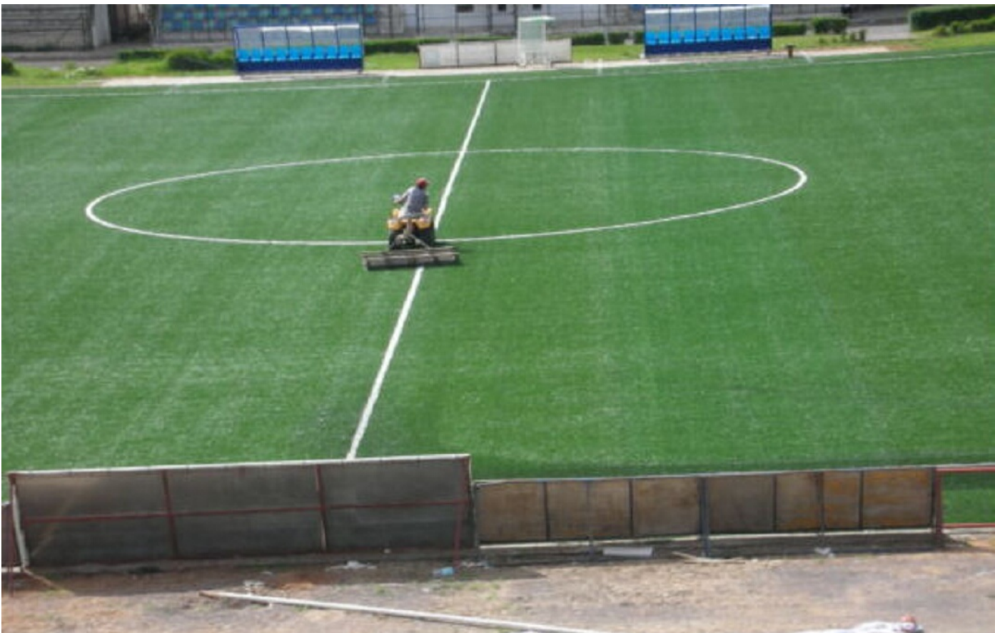
The football turf is laid and the stadium nearly ready for use