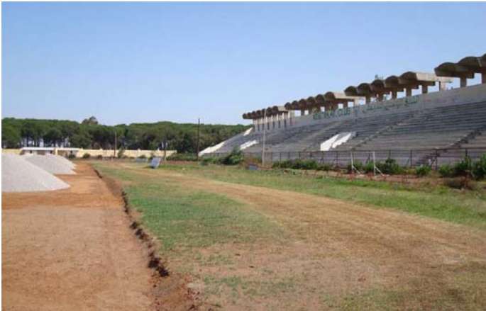
Municipality Stadium of Kénitra. Capacity: 15,000 spectators

Further information on Win in Africa with Africa: http://www.fifa.com/mm/goalprojectWinAF_E.pdf