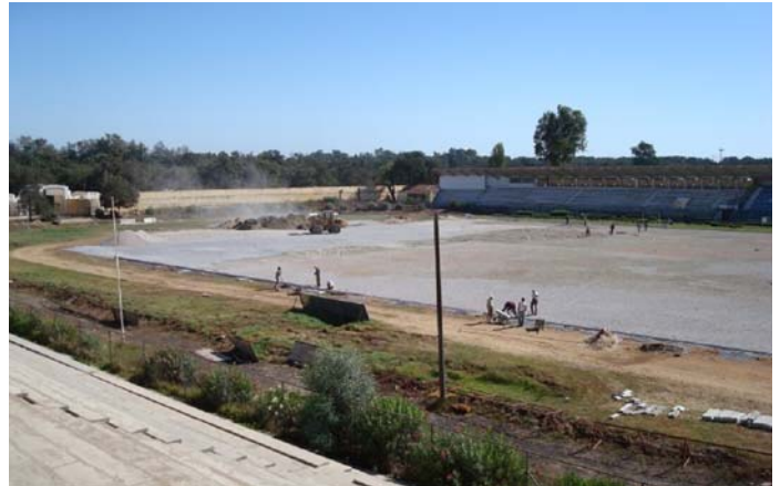
Intensive work on the preparation of the ground