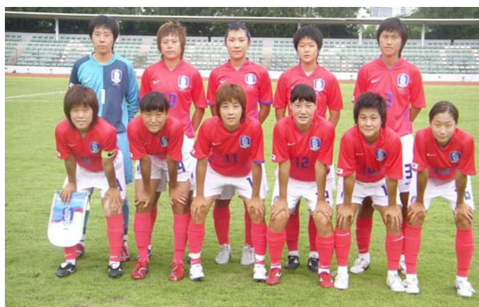
The Korea Republic women's Olympic team