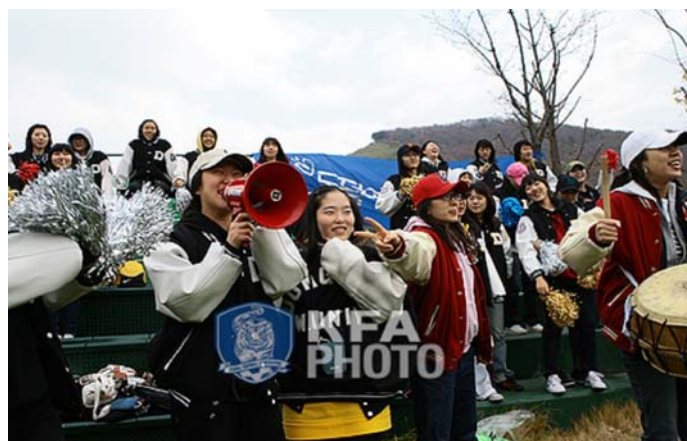
Enthusiastic Korean female fans

When, in 1995, today's FIFA President said "The future of football is feminine", it was more than mere lip service. It reflected a strong belief in the huge potential that women's football has to develop. Ever since, FIFA has given targeted support for the efforts of associations who offer women the same opportunities to develop as male players. Launched in 1998, FIFA's Financial Assistance Programme (FAP) introduced a requirement in 2004 for the associations and confederations to invest at least 4% of their FAP funding into women's football. This threshold was increased to 10% in 2005. On top of this commitment, FIFA also promotes the women's game in more general ways by directly financing women's matches and organising competitions and symposiums. Thanks to its development programmes, FIFA is also playing an active role in the training of administrators, coaches, referees and sports doctors.