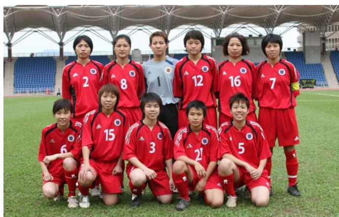
The Women's U-19 team from Hong Kong