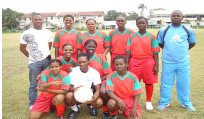
Guyana Defence Force Women