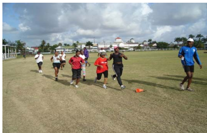
Female women referees join their male colleagues during a fitness run 2007

When, in 1995, today's FIFA President said "The future of football is feminine", it was more than mere lip service. It reflected a strong belief in the huge potential that women's football has to develop. Ever since, FIFA has given targeted support for the efforts of associations who offer women the same opportunities to develop as male players. Launched in 1998, FIFA's Financial Assistance Programme (FAP) introduced a requirement in 2004 for the associations and confederations to invest at least 4% of their FAP funding into women's football. This threshold was increased to 10% in 2005. On top of this commitment, FIFA also promotes the women's game in more general ways by directly financing women's matches and organising competitions and symposiums. Thanks to its development programmes, FIFA is also playing an active role in the training of administrators, coaches, referees and sports doctors.