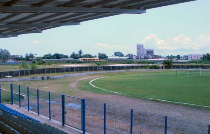
The National Stadium Divonguy, Port Gentil

Further information on Win in Africa with Africa: http://www.fifa.com/mm/goalprojectWinAF_E.pdf