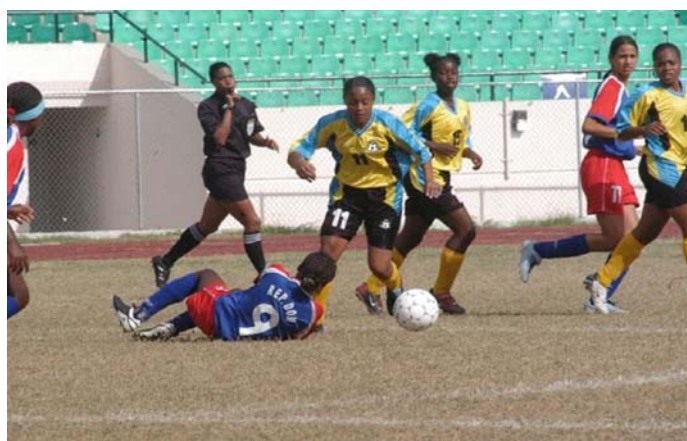
International match versus Bahamas