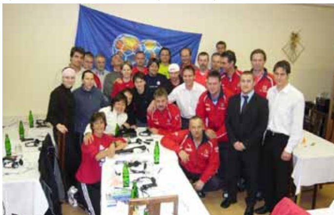
FIFA women's football seminar, 2008