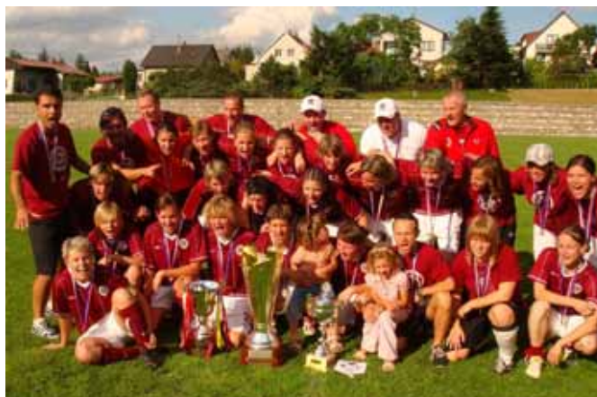
Sparta Praha - 2008 women's champions and cup winners

When, in 1995, today's FIFA President said "The future of football is feminine", it was more than mere lip service. It reflected a strong belief in the huge potential that women's football has to develop. Ever since, FIFA has given targeted support for the efforts of associations who offer women the same opportunities to develop as male players. Launched in 1998, FIFA's Financial Assistance Programme (FAP) introduced a requirement in 2004 for the associations and confederations to invest at least 4% of their FAP funding into women's football. This threshold was increased to 10% in 2005. On top of this commitment, FIFA also promotes the women's game in more general ways by directly financing women's matches and organising competitions and symposiums. Thanks to its development programmes, FIFA is also playing an active role in the training of administrators, coaches, referees and sports doctors.