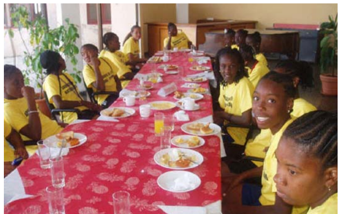
Cuba U-20 qualifiers during August 2007

Does an organised women's football set-up exist? n/a If so, since when? From which age on, players are registered? Women's teams (open or over 16 years) Women's teams (below 16 years, youth) National competition (or women's league) Regional competitions University competitions School competitions Futsal competitions National "A" team National youth teams: age categories