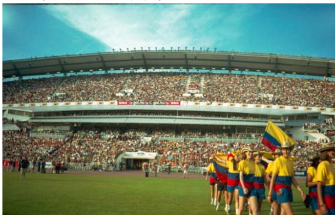
...and being on the spotlight with the national team