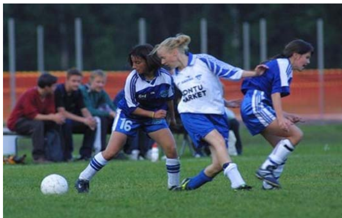
Hard-fought scene of women playing for their club ...

When, in 1995, today's FIFA President said "The future of football is feminine", it was more than mere lip service. It reflected a strong belief in the huge potential that women's football has to develop. Ever since, FIFA has given targeted support for the efforts of associations who offer women the same opportunities to develop as male players. Launched in 1998, FIFA's Financial Assistance Programme (FAP) introduced a requirement in 2004 for the associations and confederations to invest at least 4% of their FAP funding into women's football. This threshold was increased to 10% in 2005. On top of this commitment, FIFA also promotes the women's game in more general ways by directly financing women's matches and organising competitions and symposiums. Thanks to its development programmes, FIFA is also playing an active role in the training of administrators, coaches, referees and sports doctors.