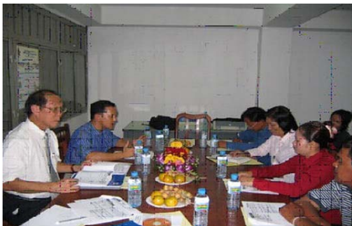
Education in women's football, course organised by FFC