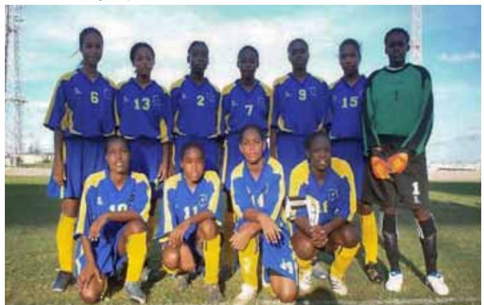
Barbados women's national team