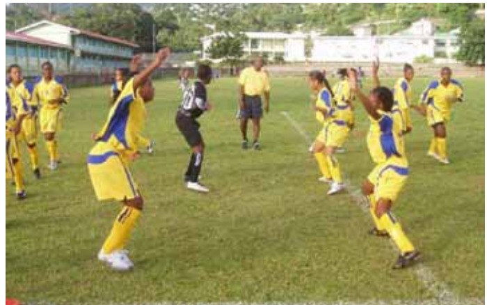
Football training or jazz dance?

When, in 1995, today's FIFA President said "The future of football is feminine", it was more than mere lip service. It reflected a strong belief in the huge potential that women's football has to develop. Ever since, FIFA has given targeted support for the efforts of associations who offer women the same opportunities to develop as male players. Launched in 1998, FIFA's Financial Assistance Programme (FAP) introduced a requirement in 2004 for the associations and confederations to invest at least 4% of their FAP funding into women's football. This threshold was increased to 10% in 2005. On top of this commitment, FIFA also promotes the women's game in more general ways by directly financing women's matches and organising competitions and symposiums. Thanks to its development programmes, FIFA is also playing an active role in the training of administrators, coaches, referees and sports doctors.