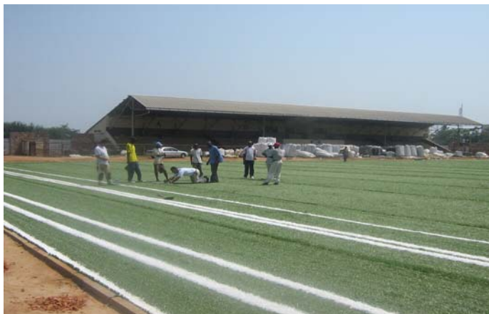
During the renovation work.