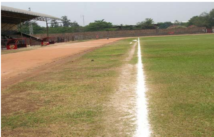
The Stade Prince Louis Rwagasore, Bujumbura before the playing surface was renovated.

Further information on Win in Africa with Africa: http://www.fifa.com/mm/goalprojectWinAF_E.pdf