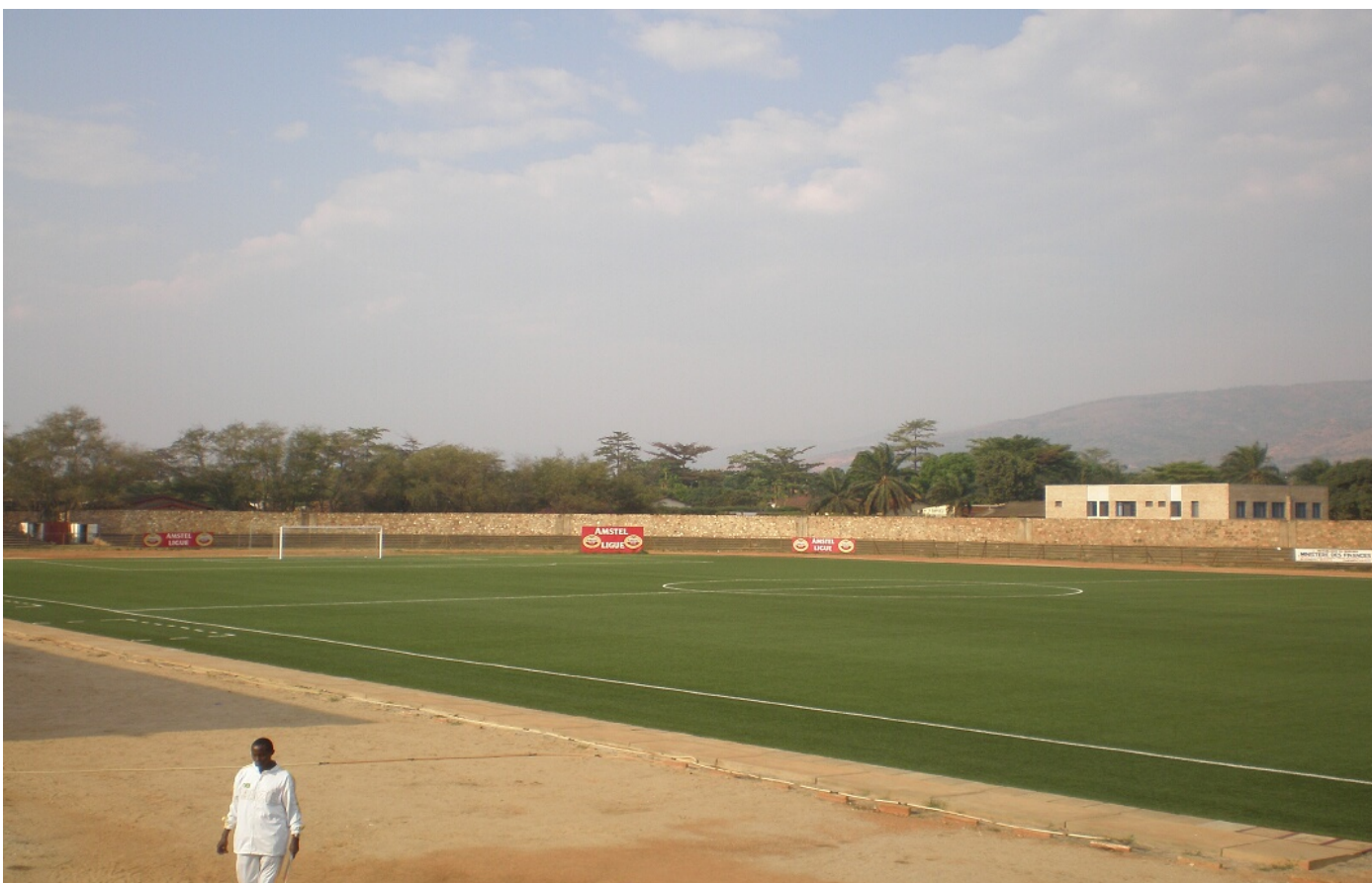
The eight-team CECAFA U-17 international tournament was played on this surface in August 2007.