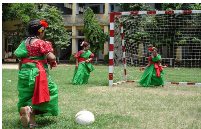
Unpractical but beautiful - the Bangladeshi contribution to the sportswear