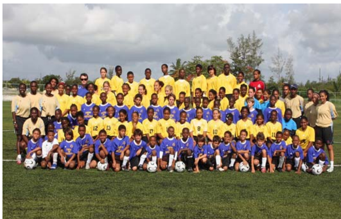
National Academy 2008