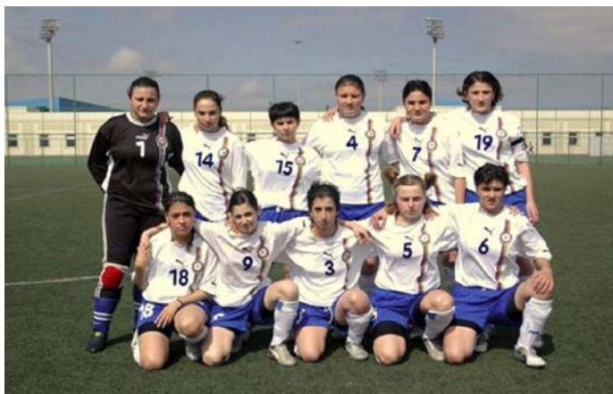
Azerbaijan women's senior national team