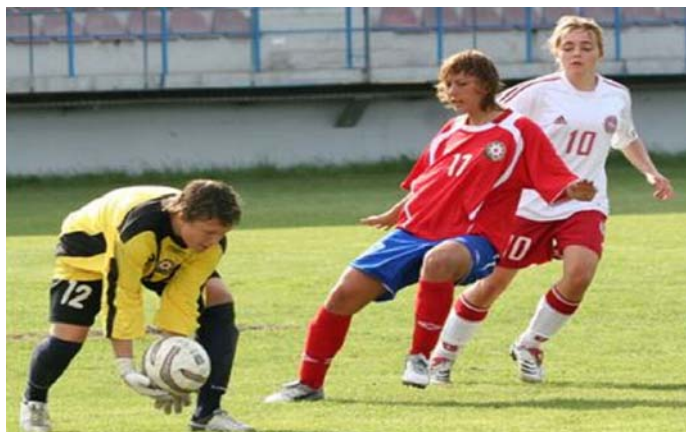
The U-19 women's national team in action

When, in 1995, today's FIFA President said "The future of football is feminine", it was more than mere lip service. It reflected a strong belief in the huge potential that women's football has to develop. Ever since, FIFA has given targeted support for the efforts of associations who offer women the same opportunities to develop as male players. Launched in 1998, FIFA's Financial Assistance Programme (FAP) introduced a requirement in 2004 for the associations and confederations to invest at least 4% of their FAP funding into women's football. This threshold was increased to 10% in 2005. On top of this commitment, FIFA also promotes the women's game in more general ways by directly financing women's matches and organising competitions and symposiums. Thanks to its development programmes, FIFA is also playing an active role in the training of administrators, coaches, referees and sports doctors.