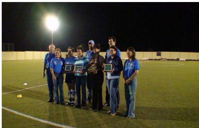
The Aruban FA Committee for Women's Football

When, in 1995, today's FIFA President said "The future of football is feminine", it was more than mere lip service. It reflected a strong belief in the huge potential that women's football has to develop. Ever since, FIFA has given targeted support for the efforts of associations who offer women the same opportunities to develop as male players. Launched in 1998, FIFA's Financial Assistance Programme (FAP) introduced a requirement in 2004 for the associations and confederations to invest at least 4% of their FAP funding into women's football. This threshold was increased to 10% in 2005. On top of this commitment, FIFA also promotes the women's game in more general ways by directly financing women's matches and organising competitions and symposiums. Thanks to its development programmes, FIFA is also playing an active role in the training of administrators, coaches, referees and sports doctors.