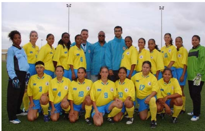
The 2006 women's national team