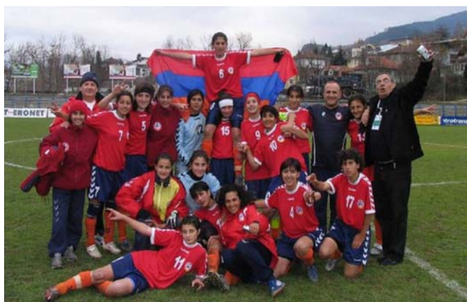
Armenia U-19 national women's team

When, in 1995, today's FIFA President said "The future of football is feminine", it was more than mere lip service. It reflected a strong belief in the huge potential that women's football has to develop. Ever since, FIFA has given targeted support for the efforts of associations who offer women the same opportunities to develop as male players. Launched in 1998, FIFA's Financial Assistance Programme (FAP) introduced a requirement in 2004 for the associations and confederations to invest at least 4% of their FAP funding into women's football. This threshold was increased to 10% in 2005. On top of this commitment, FIFA also promotes the women's game in more general ways by directly financing women's matches and organising competitions and symposiums. Thanks to its development programmes, FIFA is also playing an active role in the training of administrators, coaches, referees and sports doctors.