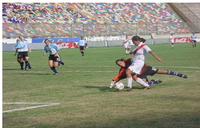
Top-level football: Peru v. Argentina (at a tournament in Peru)

When, in 1995, today's FIFA President said "The future of football is feminine", it was more than mere lip service. It reflected a strong belief in the huge potential that women's football has to develop. Ever since, FIFA has given targeted support for the efforts of associations who offer women the same opportunities to develop as male players. Launched in 1998, FIFA's Financial Assistance Programme (FAP) introduced a requirement in 2004 for the associations and confederations to invest at least 4% of their FAP funding into women's football. This threshold was increased to 10% in 2005. On top of this commitment, FIFA also promotes the women's game in more general ways by directly financing women's matches and organising competitions and symposiums. Thanks to its development programmes, FIFA is also playing an active role in the training of administrators, coaches, referees and sports doctors.