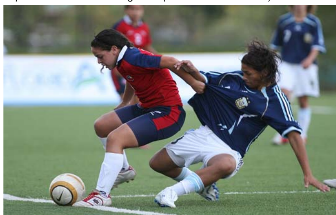
Hard-fought scene from Argentina versus Chile