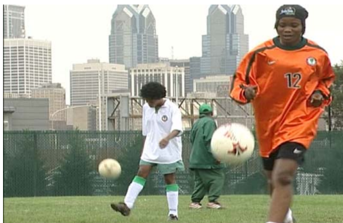
Training pitch on the top of a building in Algiers

When, in 1995, today's FIFA President said "The future of football is feminine", it was more than mere lip service. It reflected a strong belief in the huge potential that women's football has to develop. Ever since, FIFA has given targeted support for the efforts of associations who offer women the same opportunities to develop as male players. Launched in 1998, FIFA's Financial Assistance Programme (FAP) introduced a requirement in 2004 for the associations and confederations to invest at least 4% of their FAP funding into women's football. This threshold was increased to 10% in 2005. On top of this commitment, FIFA also promotes the women's game in more general ways by directly financing women's matches and organising competitions and symposiums. Thanks to its development programmes, FIFA is also playing an active role in the training of administrators, coaches, referees and sports doctors.