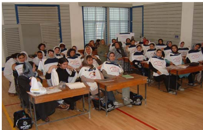
Theory lesson in Kabul

When, in 1995, today's FIFA President said "The future of football is feminine", it was more than mere lip service. It reflected a strong belief in the huge potential that women's football has to develop. Ever since, FIFA has given targeted support for the efforts of associations who offer women the same opportunities to develop as male players. Launched in 1998, FIFA's Financial Assistance Programme (FAP) introduced a requirement in 2004 for the associations and confederations to invest at least 4% of their FAP funding into women's football. This threshold was increased to 10% in 2005. On top of this commitment, FIFA also promotes the women's game in more general ways by directly financing women's matches and organising competitions and symposiums. Thanks to its development programmes, FIFA is also playing an active role in the training of administrators, coaches, referees and sports doctors.