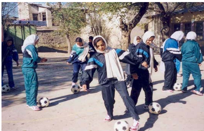
Practical training during a women's football workshop

Does an organised women's football set-up exist? yes If so, since when? 2004 From which age on, players are registered? 16 Women's teams (open or over 16 years) 17 Women's teams (below 16 years, youth) 0 National competition (or women's league) yes Regional competitions no University competitions no School competitions no Futsal competitions no National "A" team no National youth teams: age categories no