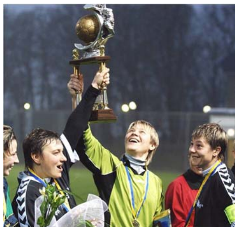
National Championship winners

When, in 1995, today's FIFA President said "The future of football is feminine", it was more than mere lip service. It reflected a strong belief in the huge potential that women's football has to develop. Ever since, FIFA has given targeted support for the efforts of associations who offer women the same opportunities to develop as male players. Launched in 1998, FIFA's Financial Assistance Programme (FAP) introduced a requirement in 2004 for the associations and confederations to invest at least 4% of their FAP funding into women's football. This threshold was increased to 10% in 2005. On top of this commitment, FIFA also promotes the women's game in more general ways by directly financing women's matches and organising competitions and symposiums. Thanks to its development programmes, FIFA is also playing an active role in the training of administrators, coaches, referees and sports doctors.