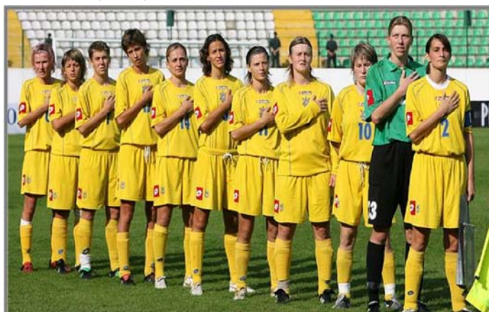
The Ukraine women's national team

Does an organised women's football set-up exist? yes If so, since when? 1991 From which age on, players are registered? 15 Women's teams (open or over 16 years) 10 Women's teams (below 16 years, youth) 22 National competition (or women's league) yes Regional competitions yes University competitions yes School competitions yes Futsal competitions yes National "A" team yes National youth teams: age categories U-17, U-19