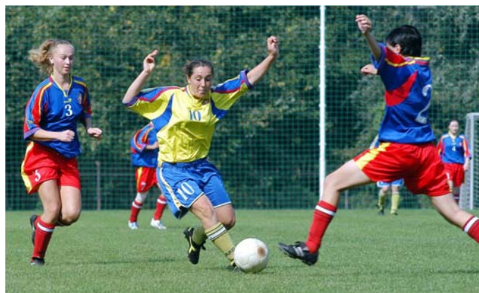
The Moldovan women's national team in full action