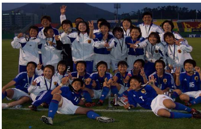
The U-16 Women's National Team

When, in 1995, today's FIFA President said "The future of football is feminine", it was more than mere lip service. It reflected a strong belief in the huge potential that women's football has to develop. Ever since, FIFA has given targeted support for the efforts of associations who offer women the same opportunities to develop as male players. Launched in 1998, FIFA's Financial Assistance Programme (FAP) introduced a requirement in 2004 for the associations and confederations to invest at least 4% of their FAP funding into women's football. This threshold was increased to 10% in 2005. On top of this commitment, FIFA also promotes the women's game in more general ways by directly financing women's matches and organising competitions and symposiums. Thanks to its development programmes, FIFA is also playing an active role in the training of administrators, coaches, referees and sports doctors.