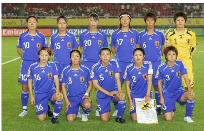
The Japan Women's "A" National Team