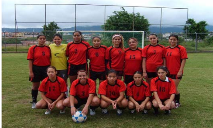
The Honduras women's national team