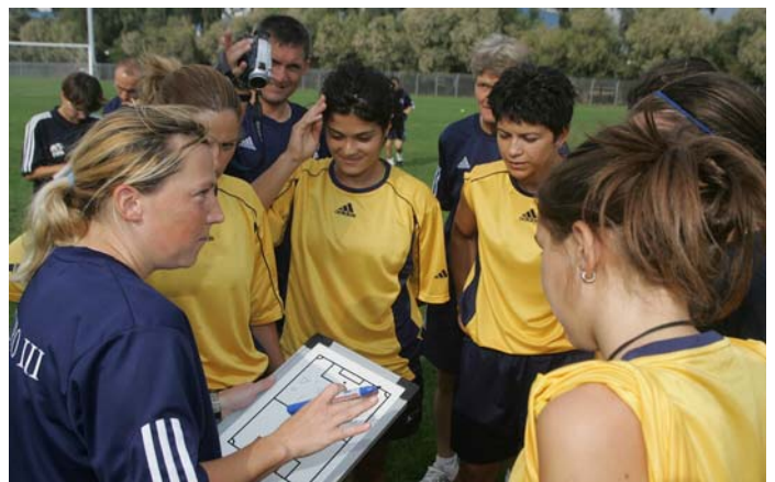
Futuro III course for women's football in Greece