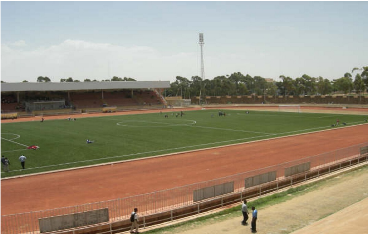
The Asmara Stadium shortly before being re-opened.