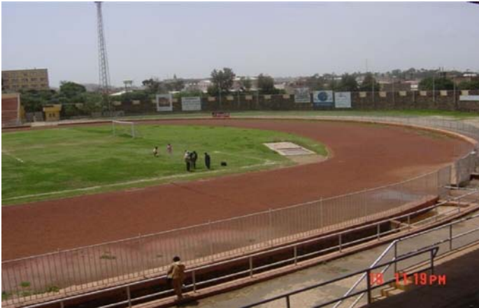
The Asmara National Stadium before the installation of a football turf pitch.

Further information on Win in Africa with Africa: http://www.fifa.com/mm/goalprojectWinAF_E.pdf