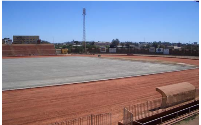
Preparation of the ground.