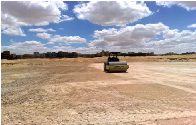
Training centre in 6 October City, Giza

Further information on Win in Africa with Africa: http://www.fifa.com/mm/goalprojectWinAF_E.pdf