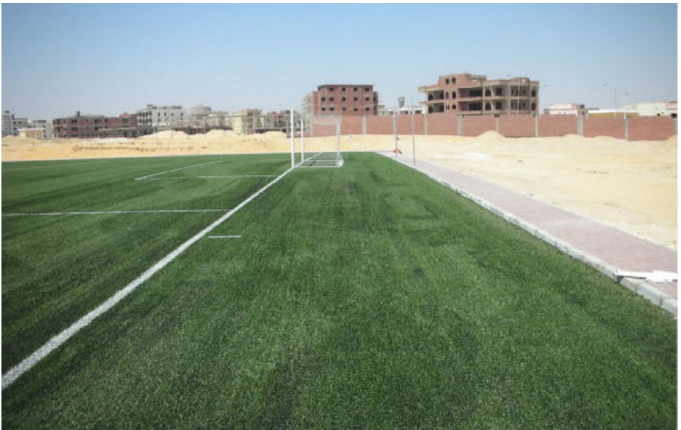
The new football turf is laid and ready for use