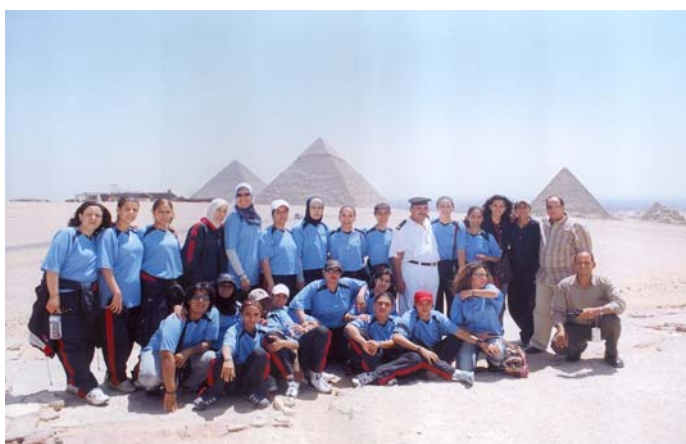
Egyptian women's referees under instruction - and in front of the pyramids