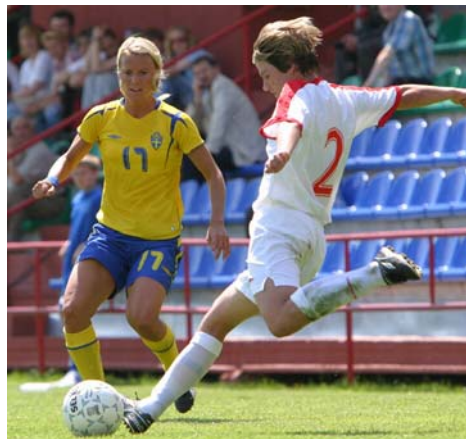
International match versus Sweden