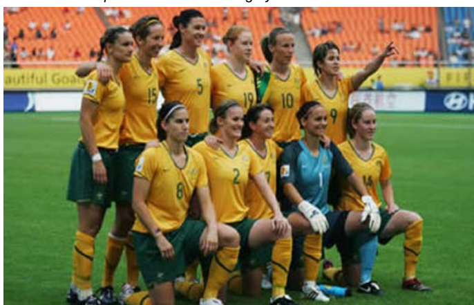
The Women's national team at the FIFA Women's World Cup in PR China