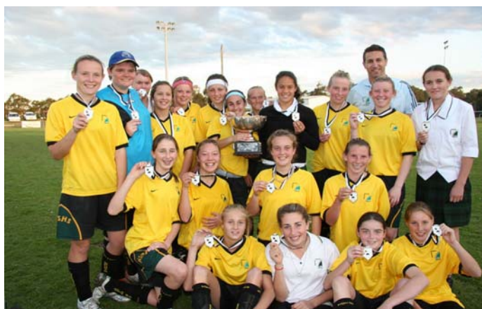
Australian champions 2007: Youth category

When, in 1995, today's FIFA President said "The future of football is feminine", it was more than mere lip service. It reflected a strong belief in the huge potential that women's football has to develop. Ever since, FIFA has given targeted support for the efforts of associations who offer women the same opportunities to develop as male players. Launched in 1998, FIFA's Financial Assistance Programme (FAP) introduced a requirement in 2004 for the associations and confederations to invest at least 4% of their FAP funding into women's football. This threshold was increased to 10% in 2005. On top of this commitment, FIFA also promotes the women's game in more general ways by directly financing women's matches and organising competitions and symposiums. Thanks to its development programmes, FIFA is also playing an active role in the training of administrators, coaches, referees and sports doctors.