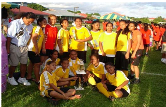
Convention with training possibilities in Pago Pago

When, in 1995, today's FIFA President said "The future of football is feminine", it was more than mere lip service. It reflected a strong belief in the huge potential that women's football has to develop. Ever since, FIFA has given targeted support for the efforts of associations who offer women the same opportunities to develop as male players. Launched in 1998, FIFA's Financial Assistance Programme (FAP) introduced a requirement in 2004 for the associations and confederations to invest at least 4% of their FAP funding into women's football. This threshold was increased to 10% in 2005. On top of this commitment, FIFA also promotes the women's game in more general ways by directly financing women's matches and organising competitions and symposiums. Thanks to its development programmes, FIFA is also playing an active role in the training of administrators, coaches, referees and sports doctors.