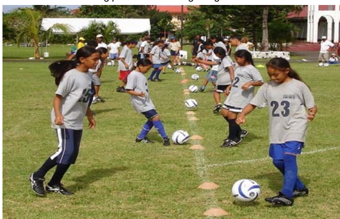
Confidence regarding future generations in American Samoa