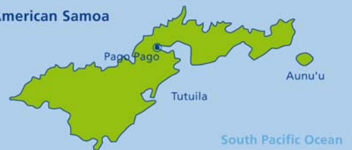
South Pacific Ocean