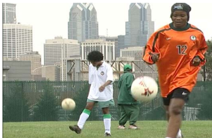
Training pitch on the top of a building in Algiers

When, in 1995, today's FIFA President said "The future of football is feminine", it was more than mere lip service. It reflected a strong belief in the huge potential that women's football has to develop. Ever since, FIFA has given targeted support for the efforts of associations who offer women the same opportunities to develop as male players. Launched in 1998, FIFA's Financial Assistance Programme (FAP) introduced a requirement in 2004 for the associations and confederations to invest at least 4% of their FAP funding into women's football. This threshold was increased to 10% in 2005. On top of this commitment, FIFA also promotes the women's game in more general ways by directly financing women's matches and organising competitions and symposiums. Thanks to its development programmes, FIFA is also playing an active role in the training of administrators, coaches, referees and sports doctors.