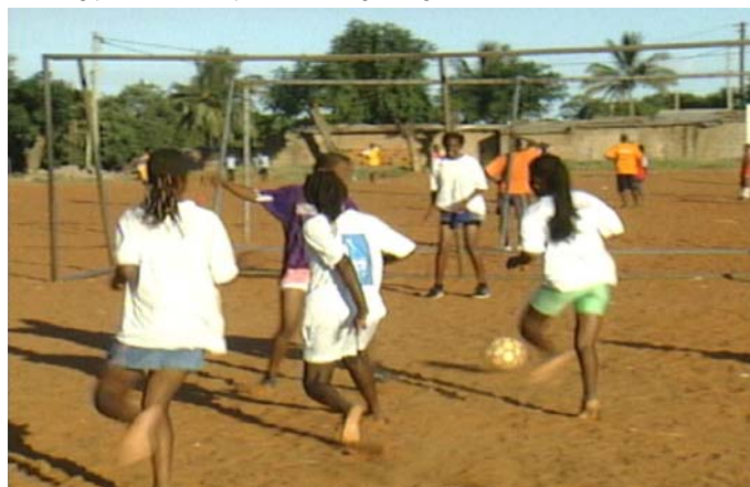
Training session on typical surfaces in countries with high temperatures