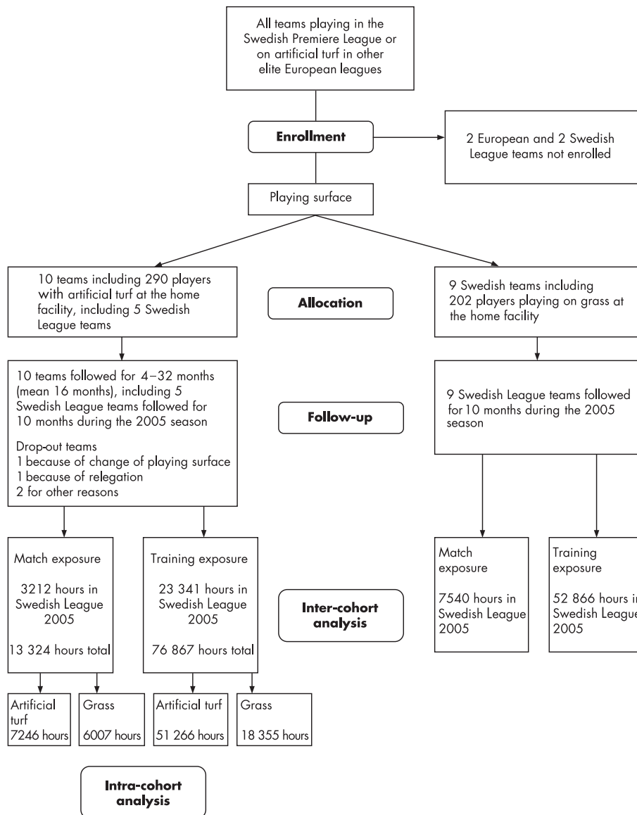
Figure 1 Flow chart of the prospective two-cohort study design and analysis.